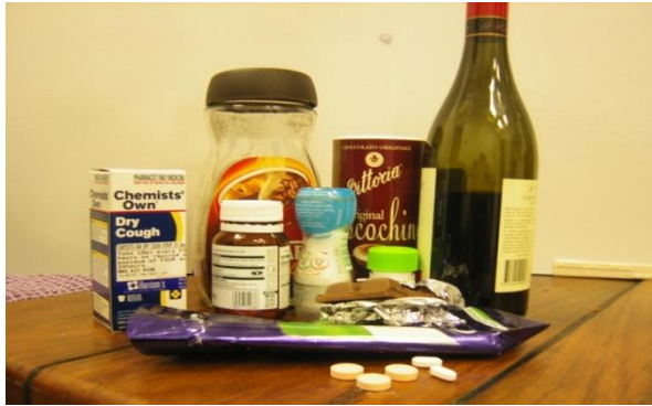
Some common potentially toxic household items to your pet